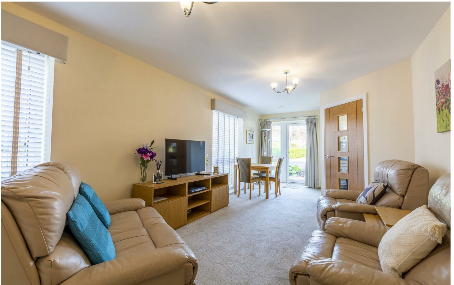
A GROUND FLOOR TWO DOUBLE BEDROOM RETIREMENT APARTMENT.

Robert Ellis are delighted to bring to the market with no upward chain, this McCarthy & Stone constructed two double bedroom ground floor apartment located within this modern over 60's retirement development situated on the Stapleford and Bramcote border.